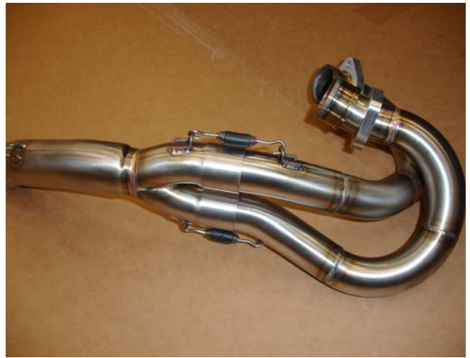
Figure 6 mid pipe with right and left assembly.