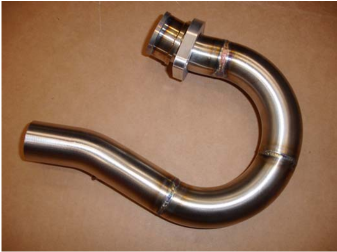
Figure 5 left side head pipe