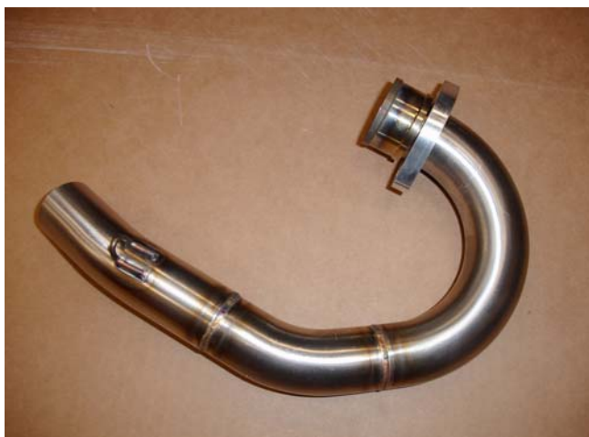
Figure 4 right side head pipe